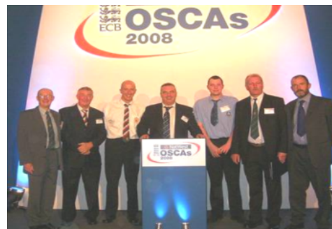
OSCA Winners at the Lords – 2008 CCB Representatives